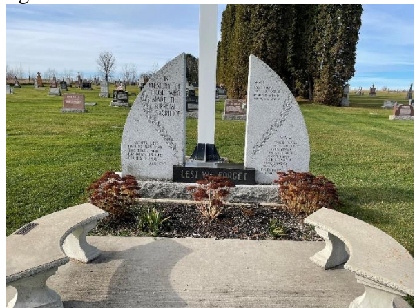
Image 3: Memorial at Our Lady of Mount Carmel Roman Catholic Cemetery 10