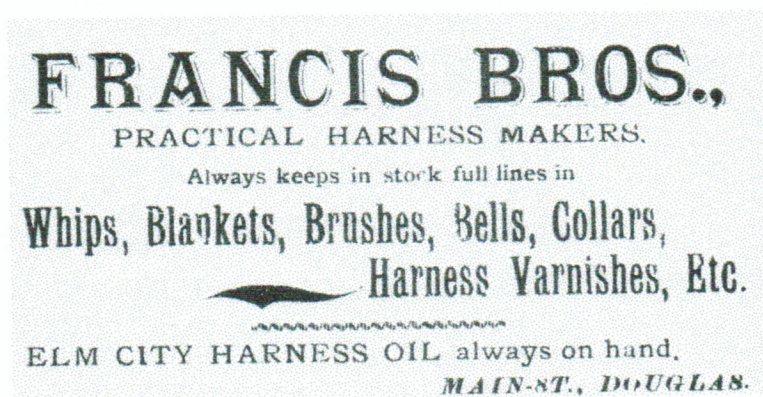
Pic 67: Advertisement for Francis Bros. Harness Makers c1980