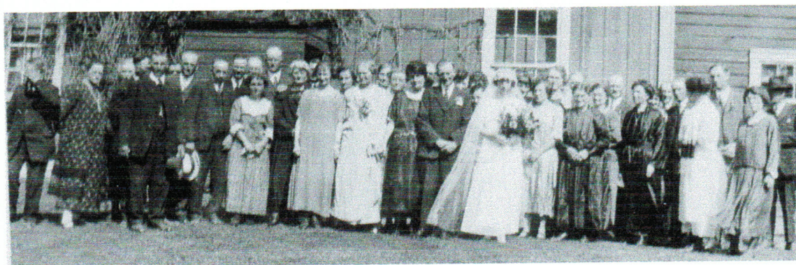
Pic 127: Wedding Guests, 1924