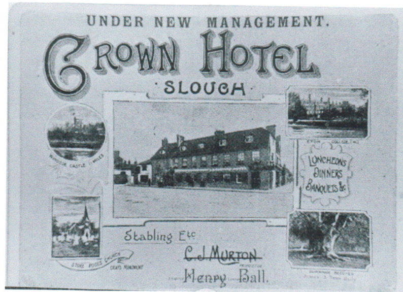
Pic 19: Post Card of the Crown Hotel