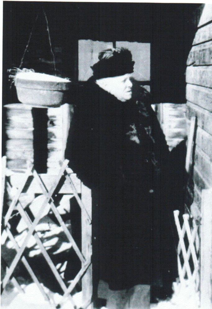
Pic 20: Granny Ball in Northern Ontario

importance was at the height of the coaching era, when it was a major staging point on the London to Bath Road. The main railway through to the West from London had its first stop there. In the 1850s the Royal Family took their first train ride to Slough, from where they traveled to Windsor.